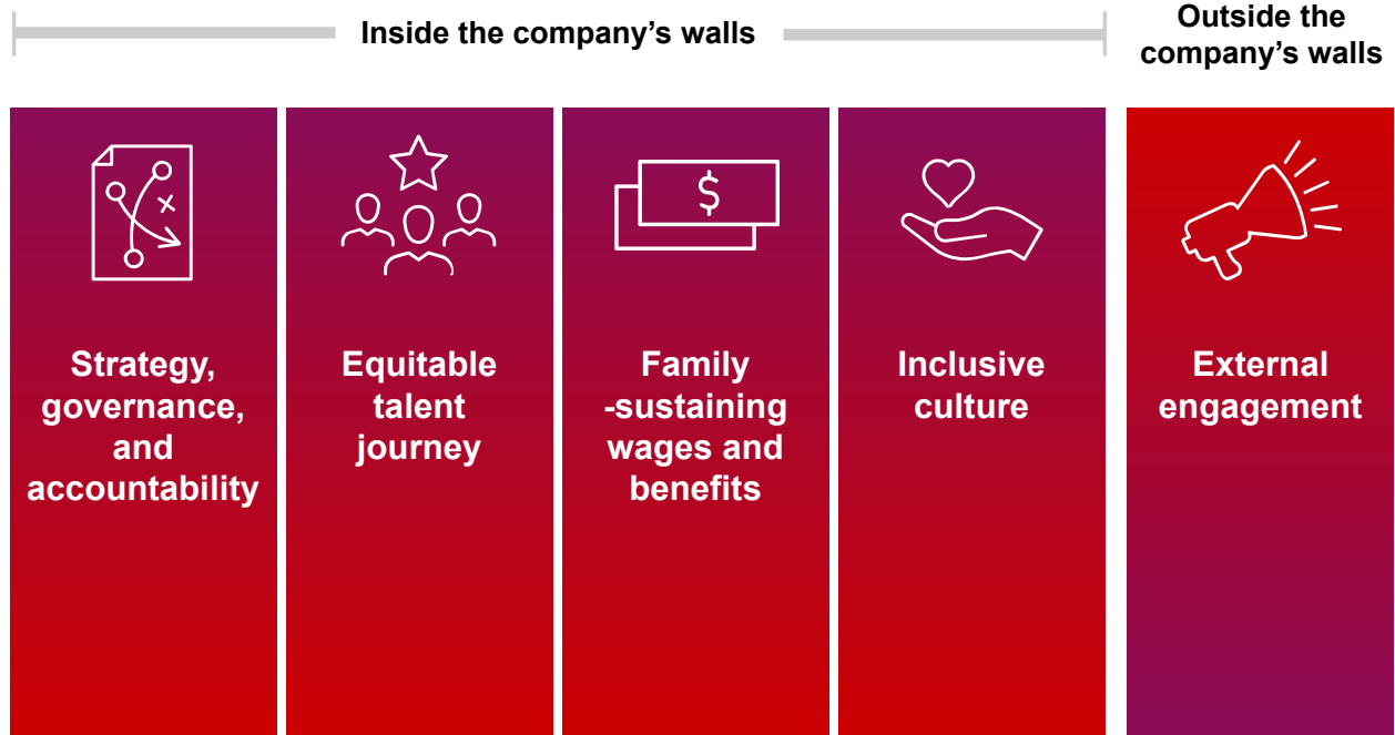
Figure 1: The most effective diversity, equity, and inclusion strategies span key areas of business operations inside and outside of the company’s walls