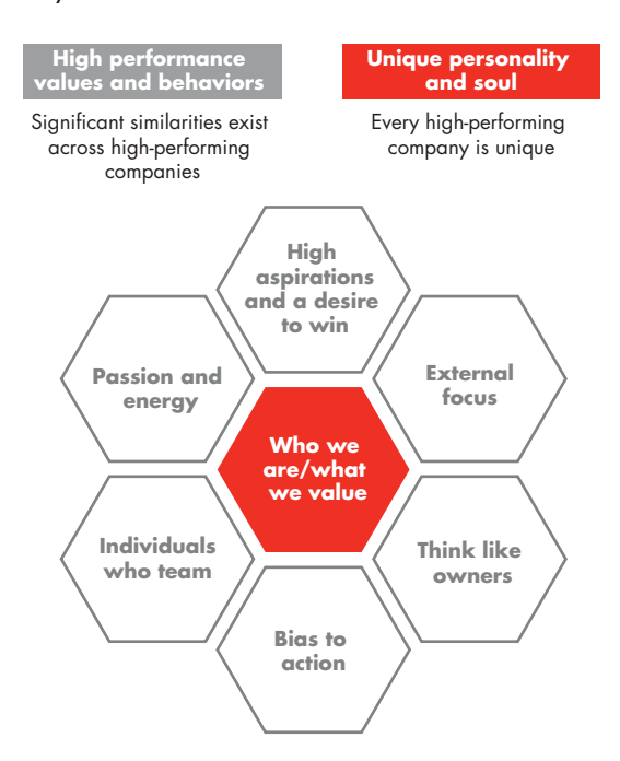
Figure 2: Winning cultures combine two key elements

business, informing day-to-day decisions and behaviors. Procter & Gamble, likewise, has managed to place the consumer at the heart of the company's culture, which keeps employees focused on "touching lives, improving life" in every market in which they participate.