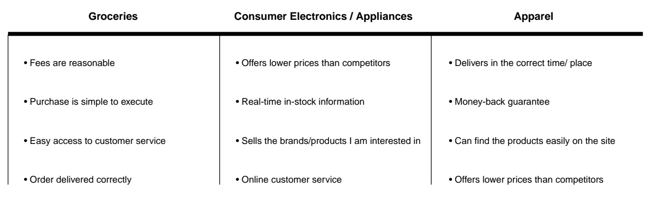
Figure 4: Repeat purchase drivers