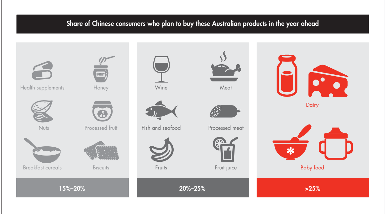
Figure 4: What Australian goods do Chinese shoppers intend to buy?