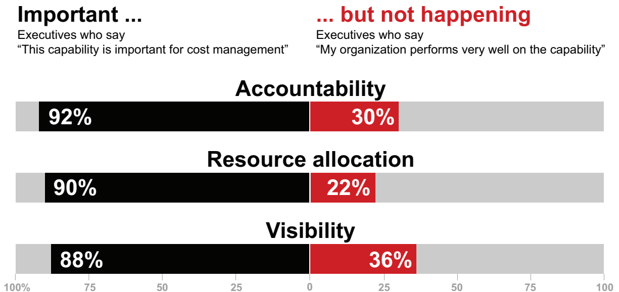
Figure 3: Pharma executives say current cost systems don’t meet their needs

To get the best results, successful companies customize ZBB programs to their organization’s culture. They determine the scope of the program based on the degree of change they are seeking and organizational readiness. They also decide which elements to manage centrally and ensure strong global category owners strike the right balance in collaborating with budget owners. Finally, leaders decide on